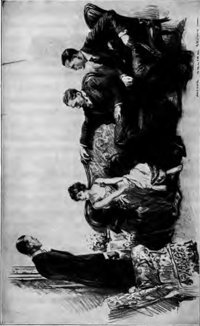
“George rose abruptly, his face the colour of wrath. ‘I shall take pleasure in calling in some other time when a more courteous sort of people may be present.’”